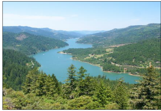
Ruth Lake.

This once-booming timber-driven community offers a dispersed rural population with limited amenities. Mad River's business and infrastructure provide basic life necessities, including a primary health care clinic, two volunteer fire departments and ambulance service, a few restaurants and bars, a store with a grocery, hardware, plumbing, garden service, feed supply, laundry facilities and gas stations. Fortuna and Eureka, offer full-service hospitals, grocery stores and shopping opportunities.